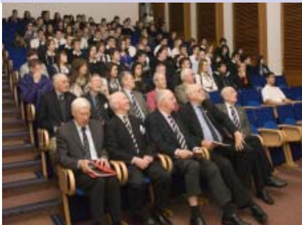
The assembled audience